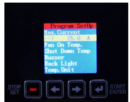
Picture 3 Program setup

value, press the START/ENTER button to the value blink then change the value with the DEC or INC buttons. The new value will be confirmed and saved by pressing the START/ENTER button